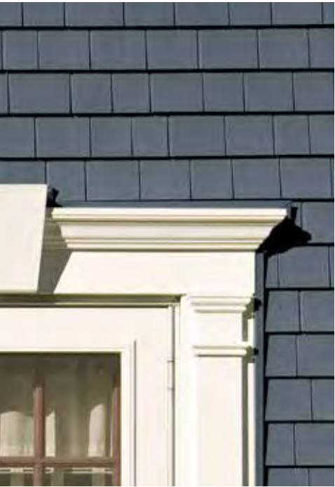
Shown in Midnight Blue.