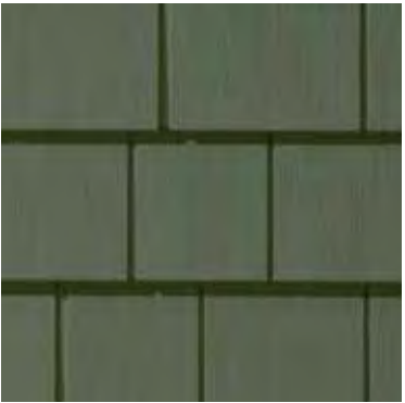
The uniform style and woodgrain texture of our Cape Cod Shingles convey classic coastal charm. Shown in Deep Moss.

Available in a traditional 5" double-course Cape Cod style cut, this masterfully crafted panel boasts a uniform woodgrain texture that recreates the subtle elegance of natural wood.