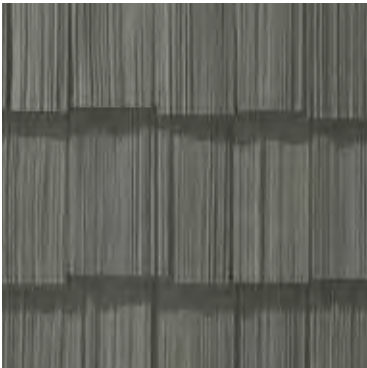
The rough-cut edge and deep texture of our 9" hand-split shake imparts genuine cedar beauty. Shown in Charcoal Smoke.

The deeply grained and random texture of the architecturally correct 9" exposure elevates hand-split shake to a new level of design. The rough-cut bottom edge, custom craftsmanship and attention to detail gently mixes the beauty of genuine cedar shake with the low-maintenance benefits of polymer technology. The result is a siding that's remarkably durable, yet warm and inviting.