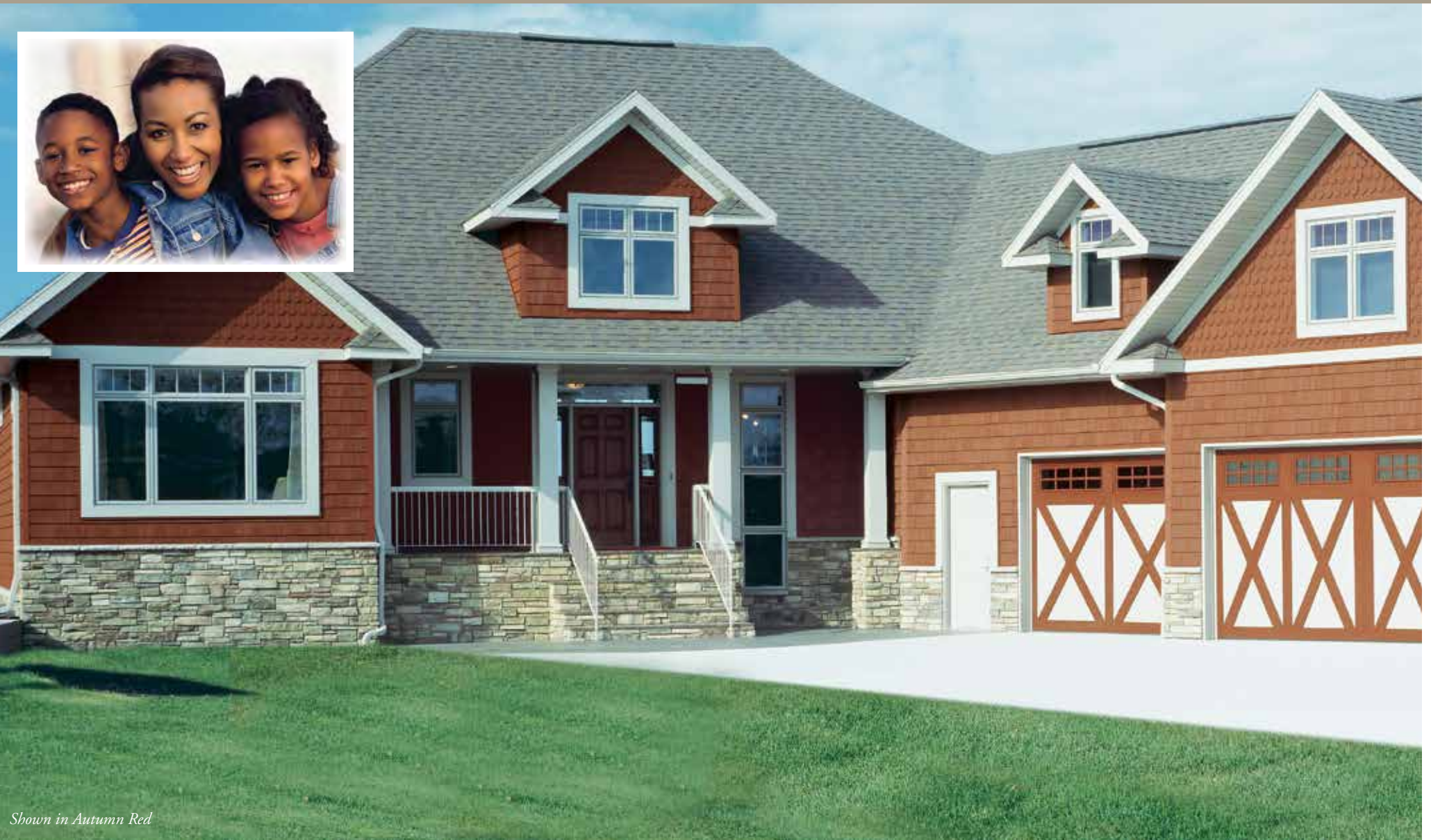
Shown in Autumn Red