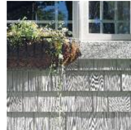
Alside Premium Shakes – the classic look of deep-grained cedar shakes.