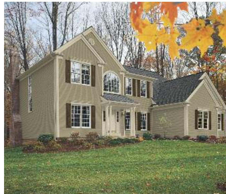
Subtle contrast. Tuscan Clay siding, Monterey Sand trim and door, Brown shutters.

ChromaTrue® ChromaTrue helps make Charter Oak better with ASA weatherable polymers which provide superior fade resistance and better performance on darker colors.