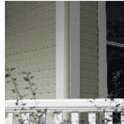
Trimworks Three-piece beaded corner post.

Alside offers a wide selection of trim and accent products made to complement the beauty and colors of Charter Oak siding.