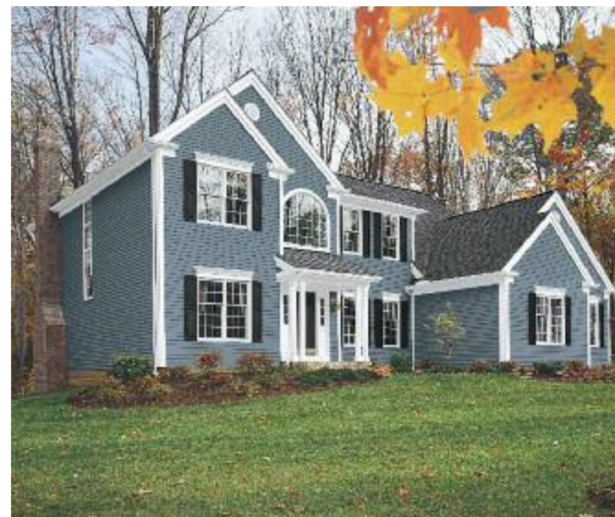
Dramatic contrast. Harbor Blue siding, Glacier White trim, Black shutters and door.

Happy with your home's exterior? Or maybe you want a new look, with different colors, more details, greater contrast.