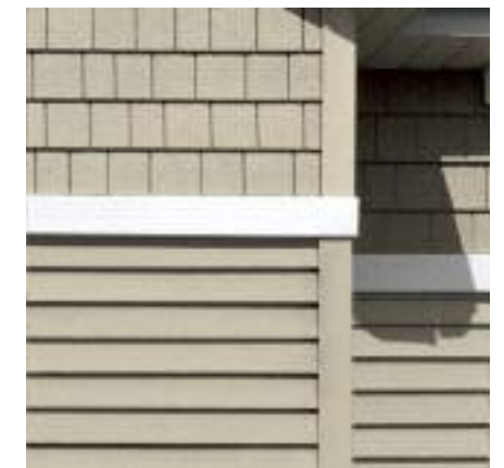
Horizontal band board provides a strong horizontal accent.