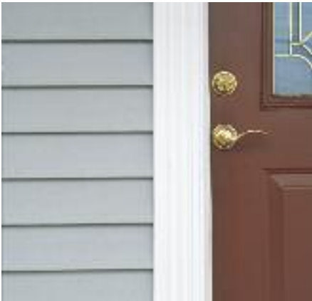
5" Trimworks fluted lineals complement this beautiful decorative door (below).