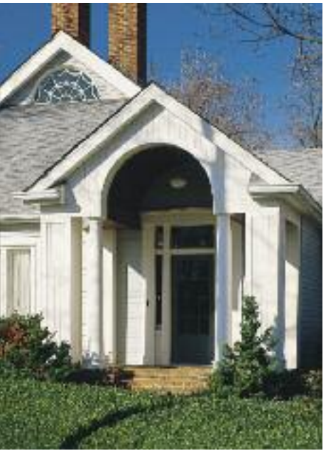
Contrast provides another way to call attention to key architectural elements. An artful contrast of vertical and horizontal siding creates an almost cathedral-like impression at the home's main entry way (above).