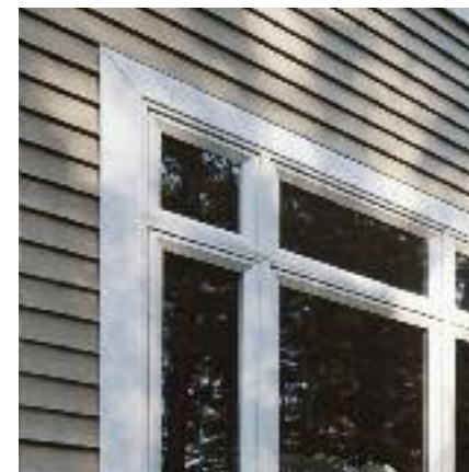
Charter Oak clapboard with Trimworks 5" window trim.