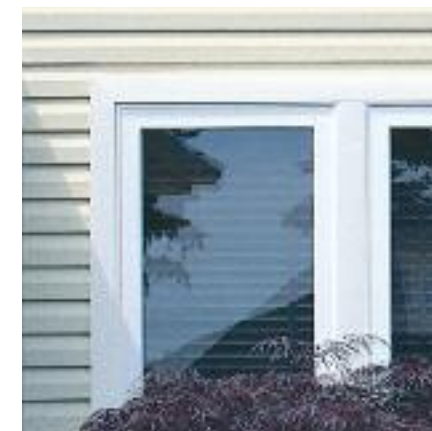
Charter Oak dutch lap with Trimworks 3 1/2" window trim.