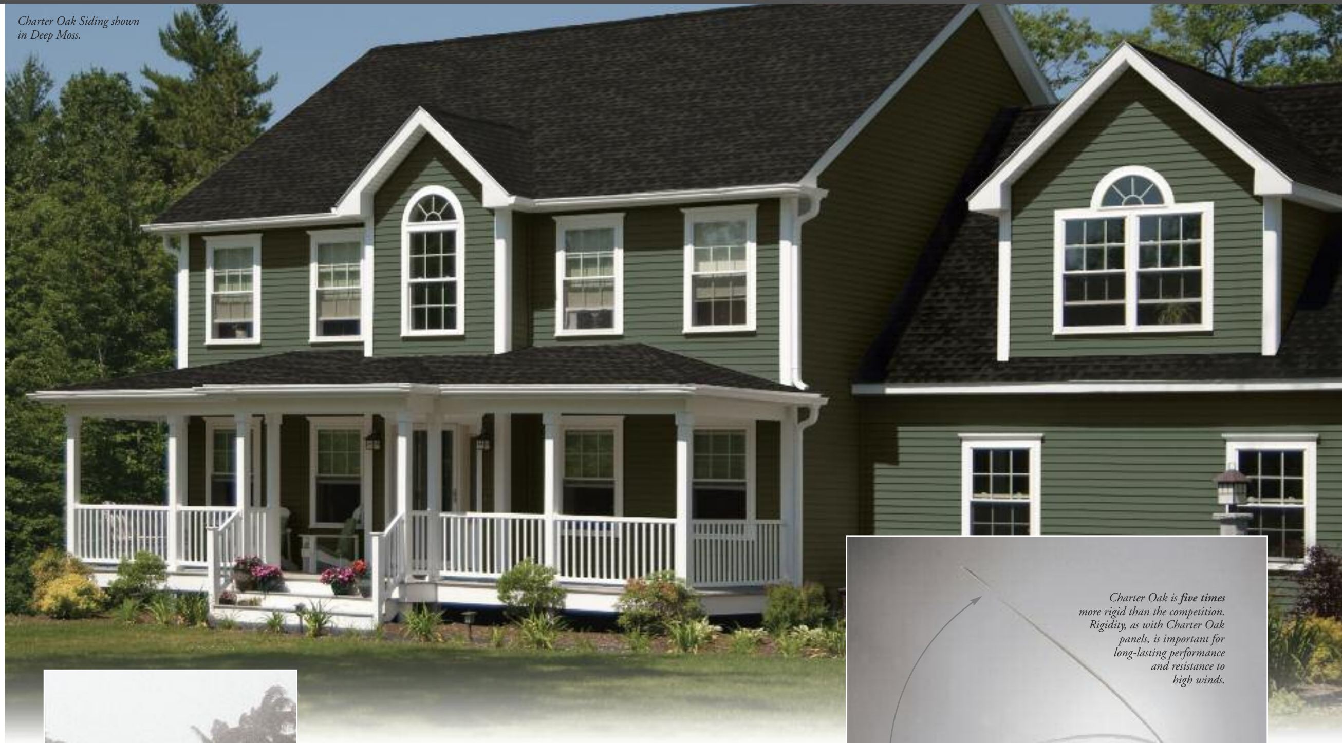
Charter Oak Siding shown in Deep Moss.

The TriBeam illustration above shows another feature that's especially important if you live in an area where high winds are common. It's a rolled-edge nail hem that gives Charter Oak its superior ability to resist the force of extreme winds. To define extreme, we put Charter Oak to another test. The result: Charter Oak stayed nailed in place in winds reaching the intensity of Category 5 hurricane winds, the designation used by the National Hurricane Center to identify the most destructive storms.