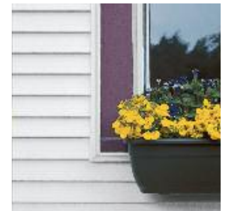
Trimworks custom crown molding used with wood window trim.