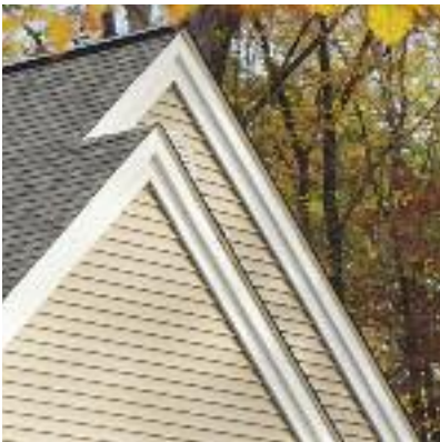
5" Trimworks lineals used as "rake" boards.