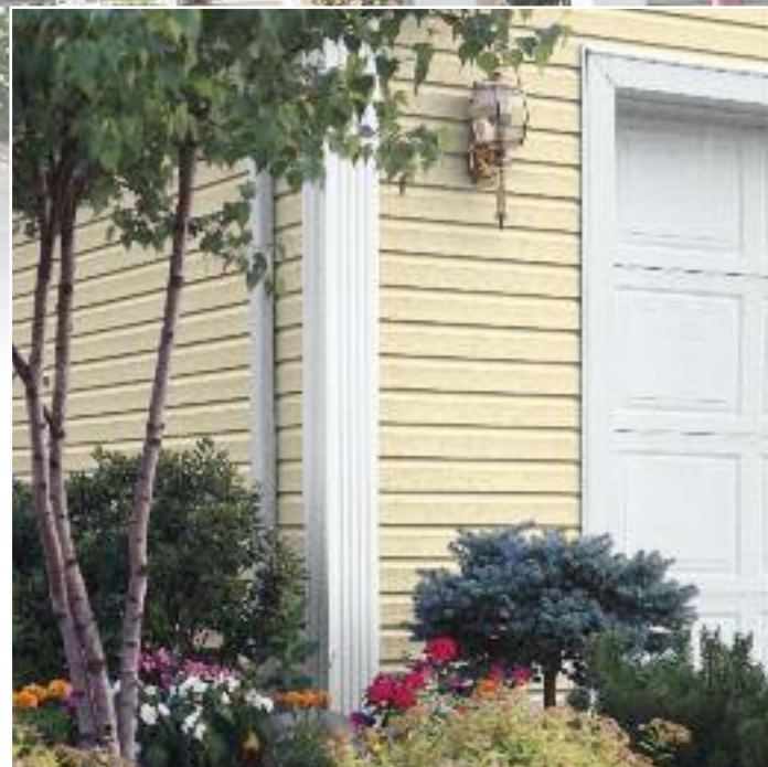
Trimworks® 7" fluted corner post. Charter Oak Siding shown in Cape Cod Gray (top of page).