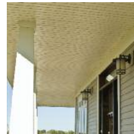
Charter Oak invisibly-vented soffit.