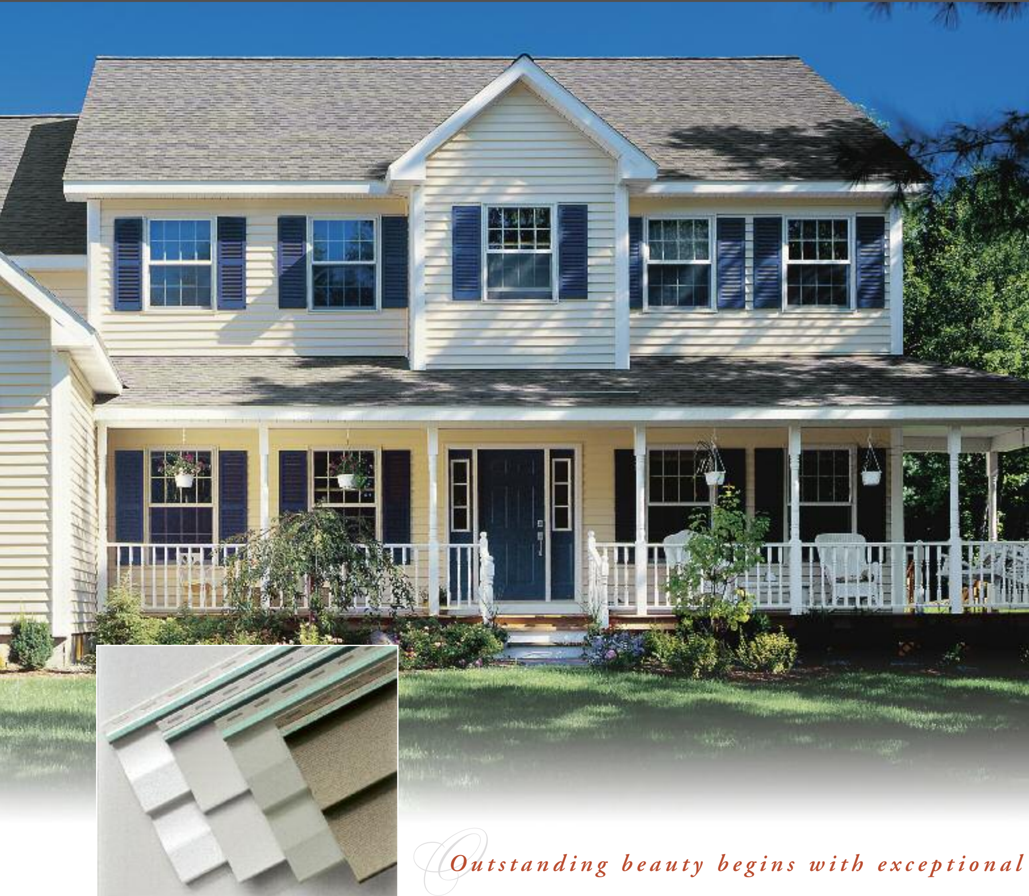
Charter Oak Siding shown in Adobe Cream (left).