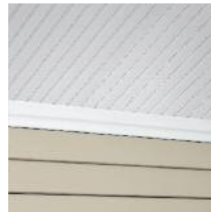
Greenbriar® Vintage Beaded soffit and Trimworks soffit crown molding.