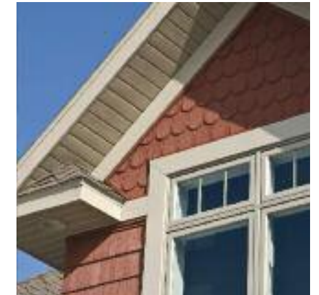
Alside Premium Scallops – Victorian inspired half-round shingles.