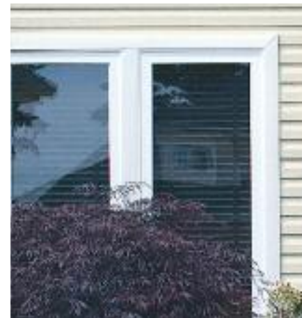
Trimworks® 3 1/2" window trim.