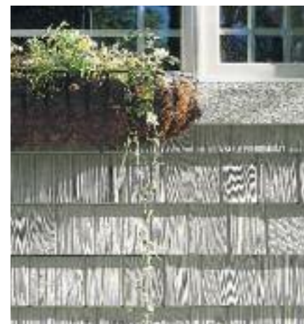
Alside Premium Shakes – the classic look of deep-grained cedar shakes.