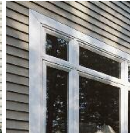
Trimworks® 5" window trim.