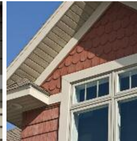
Alside Premium Scallops – Victorian inspired half-round shingles.