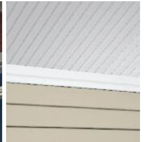
Greenbriar® Vintage Beaded soffit and Trimworks® soffit crown molding.