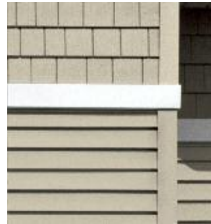
Horizontal band board provides a strong horizontal accent.

ChromaTrue ® Chroma True helps make Board & Batten better with ASA weatherable polymers which provide superior fade resistance and better performance on darker colors.