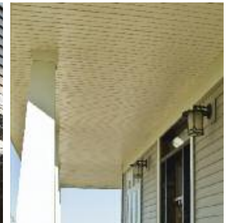
Charter Oak® invisibly-vented soffit.