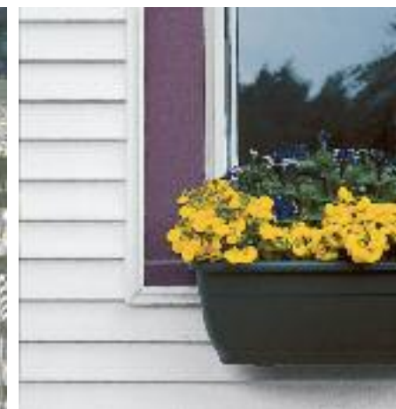
Trimworks® custom crown molding used with wood window trim.