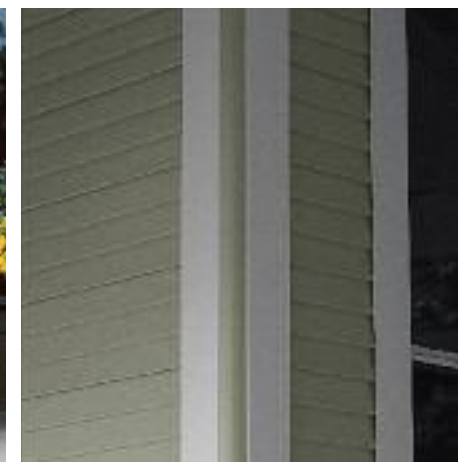
Trimworks® three-piece beaded corner post.