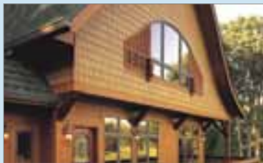
Fiber Cement Siding